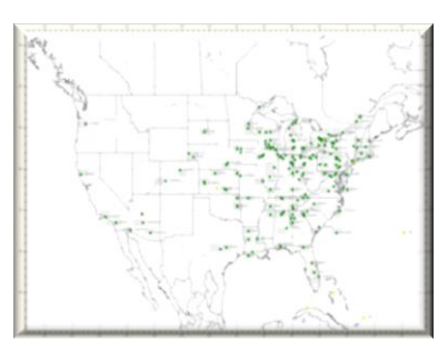
Tropo reports 7/1-8/18/2014