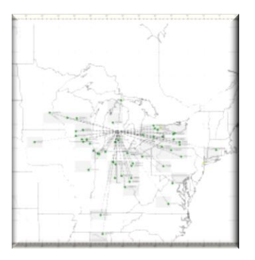
KF6A Tropo Reports