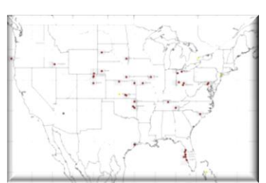
2014 2-Meter Es